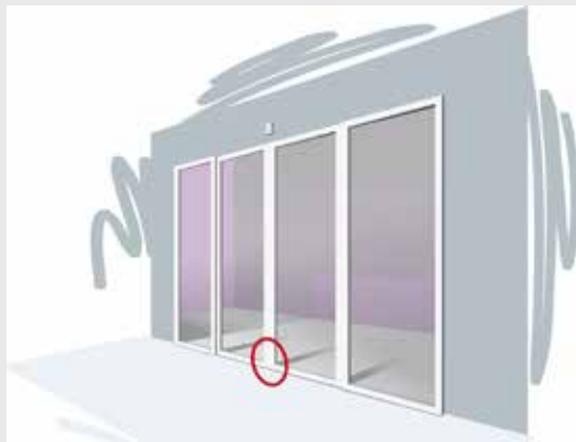
1. Basic kit

A special anti-derailing device limits the risk of someone forcing the door leaves open manually or using a crow bar.