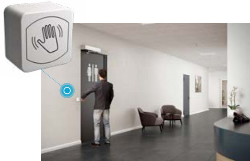
ASSA ABLOY SA13 Touchless activation unit

Activation sensors are ideal for all-access entrances. As a pedestrian approaches the door, it will automatically open, without the need for hand or elbow contact to push a switch.